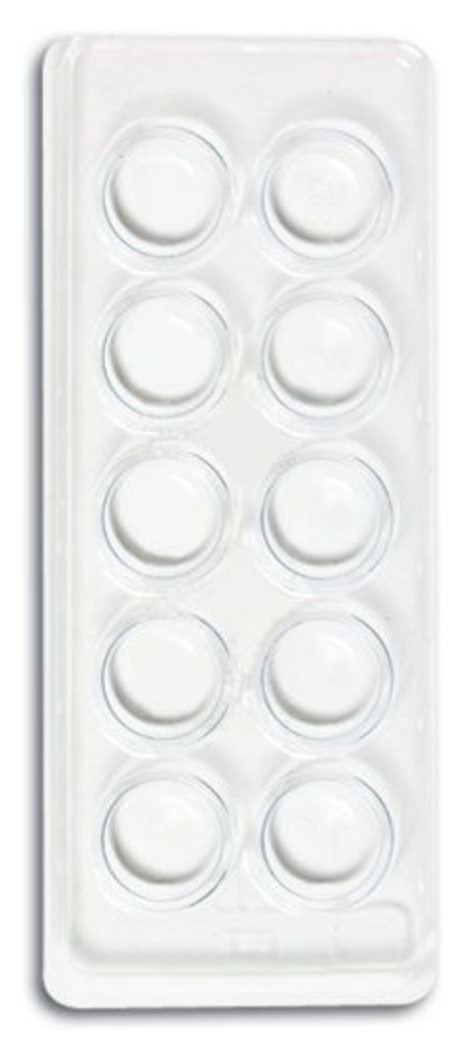
- Ideally the patch would be translucent